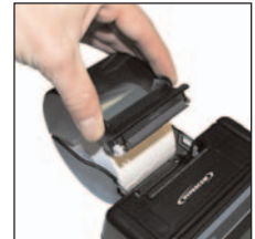
No-jam clamshell, integrated printer