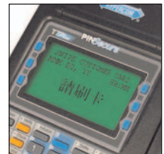
Customizable GUI display